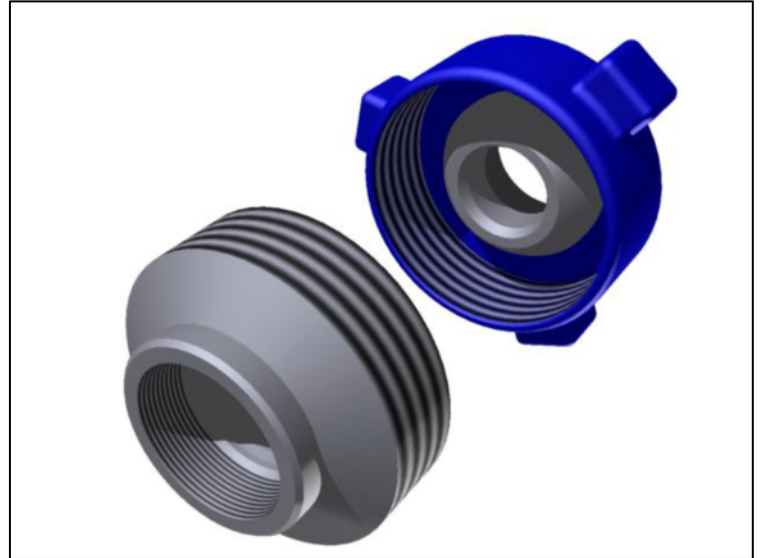
Figure 50 500 psi cwp (35 bar)

Sour gas application unions are manufactured in accordance with NACE MR-01-75. (Latest revision)